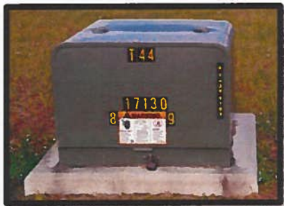
Typical Low Style Pad-Mount Transformer Typical Size: 40"L x 36"W