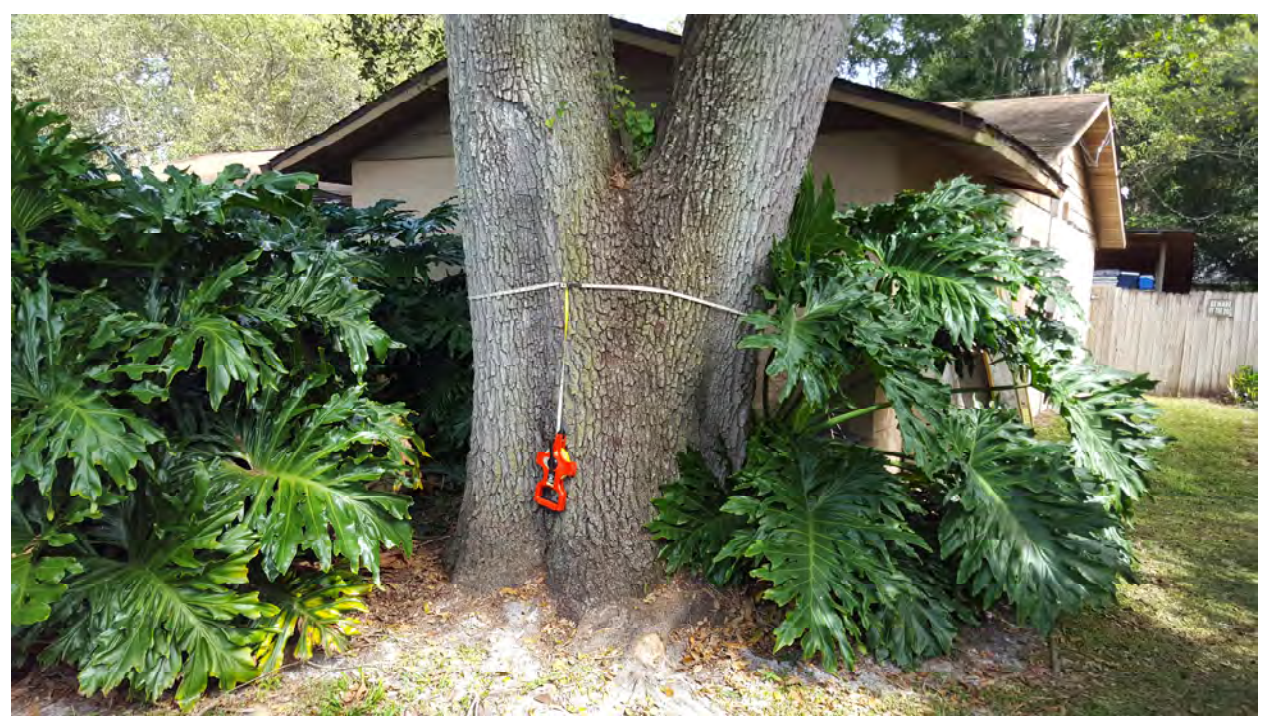
Figure 1: 47.43" DBH Trunk of subject tree showing is bifurcated with bark ridge