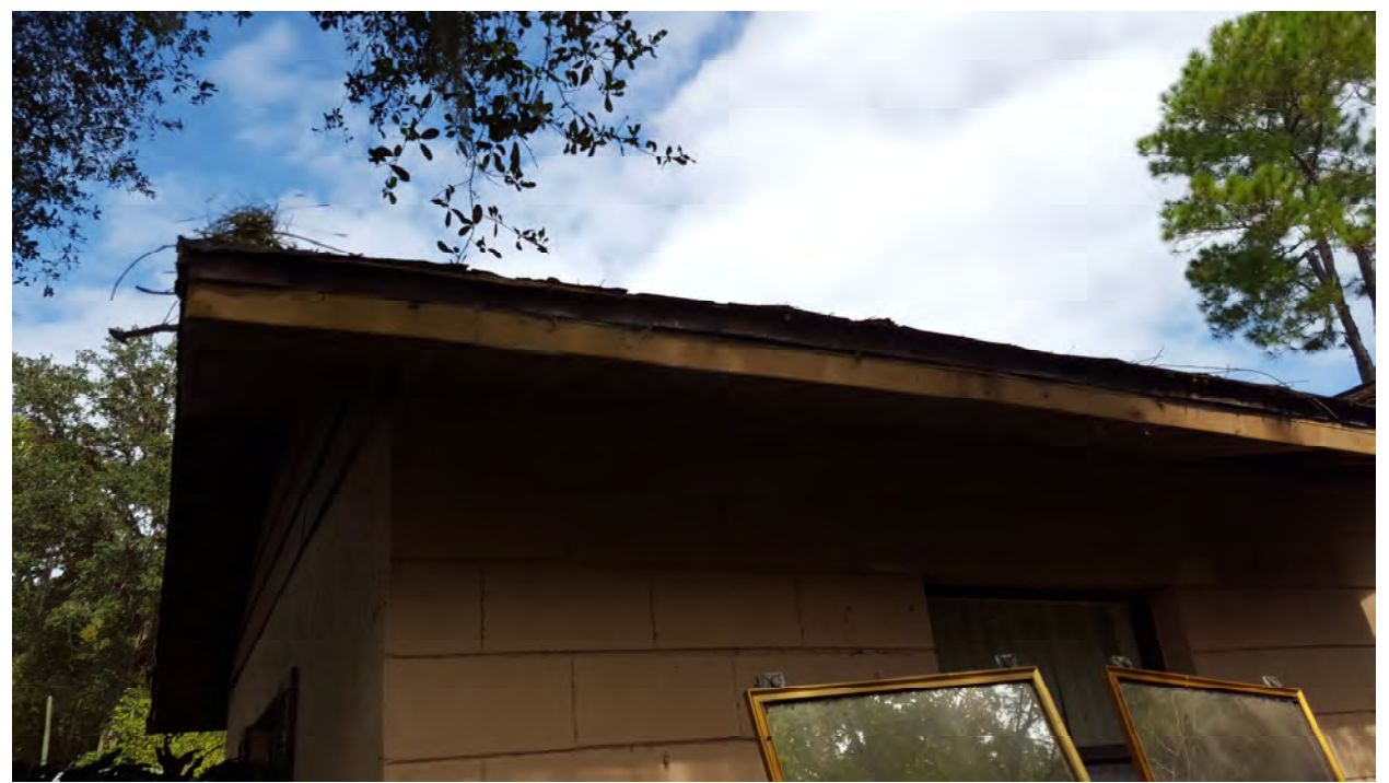
Figure 3: Subject residential property showing storm damage resulting from falling limb.

2813 Victory Palm Drive, Edgewater, FL. Arbor Report October 26, 2015 ZC 15197 Page 4 of 5