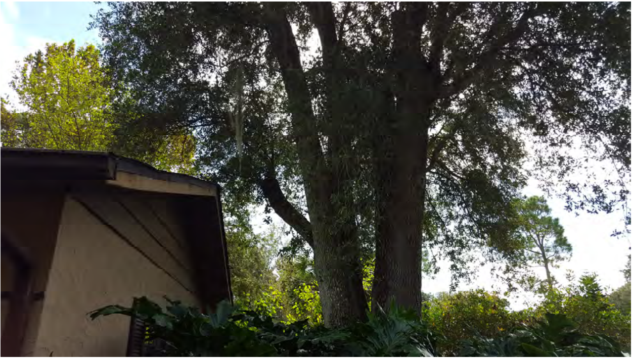
Figure 4: Trunk of subject tree observed has poorly trimmed codominant stem.