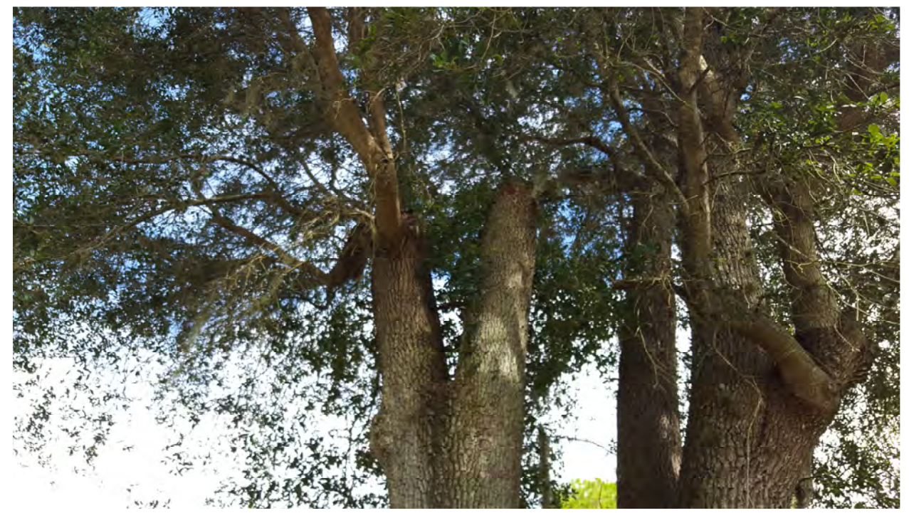
Figure 2: Codominant stems of subject tree showing bifurcation with bark ridges. Storm damage and poor trimming are apparent and the resulting lateral branching is unfavorable