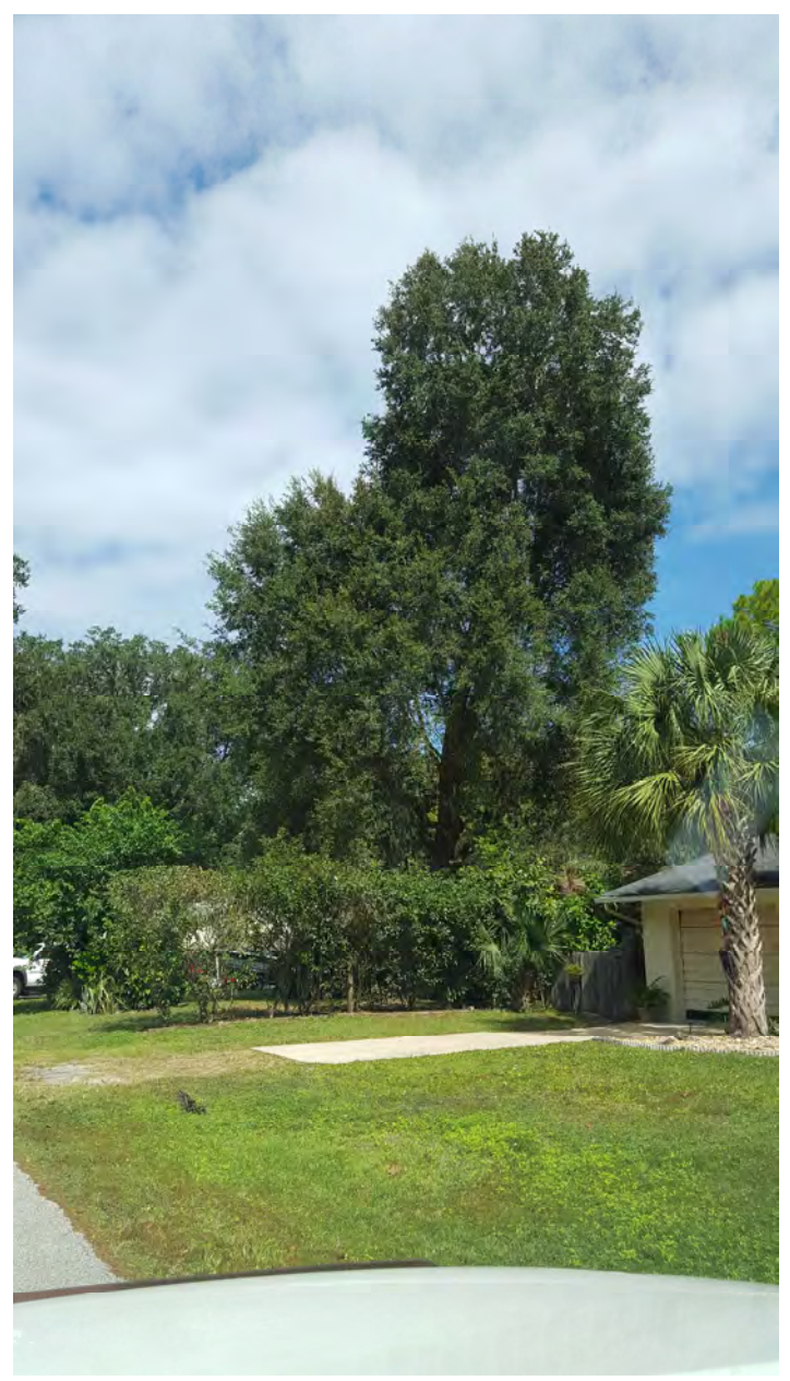
Figure 5 : Overview of tree showing has poor lateral branching.

2813 Victory Palm Drive, Edgewater, FL. Arbor Report October 26, 2015 ZC 15197 Page 5 of 5